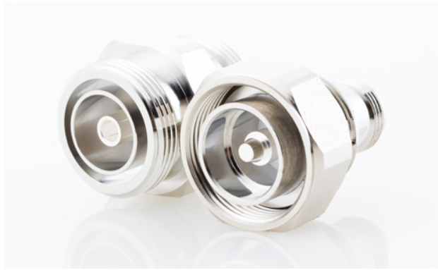
Low-PIM Adapters Selection Matrix